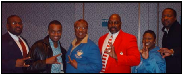
NPHCC Greeks unified throughout Chicago.