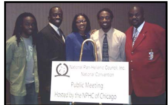
NPHCC Greeks greeting other Greeks during the Convention

Other convention highlights included an empowerment luncheon that featured guest speaker Senator Kwame Raoul of Kappa Alpha Psi Fraternity, Inc and various meetings, caucuses and workshops. The convention also featured a Stepshow/Comedy Explosion where step teams from Sigma Gamma Rho Sorority, Inc. and Kappa Alpha Psi Fraternity, Inc. were the featured attractions. All Story Clip Art courtesy of www.nphcq.org