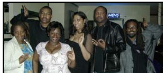
NPHCC Networking & Fundraising Committee

On March 31, 2006, the Networking Social and Fundraising (NSF) committee took the National Pan-Hellenic Council of Chicago, Inc. (NPHCC) "Back to the Basics" at its spring social. The Divine Nine left a lasting impression on the T&JJ's venue, located in